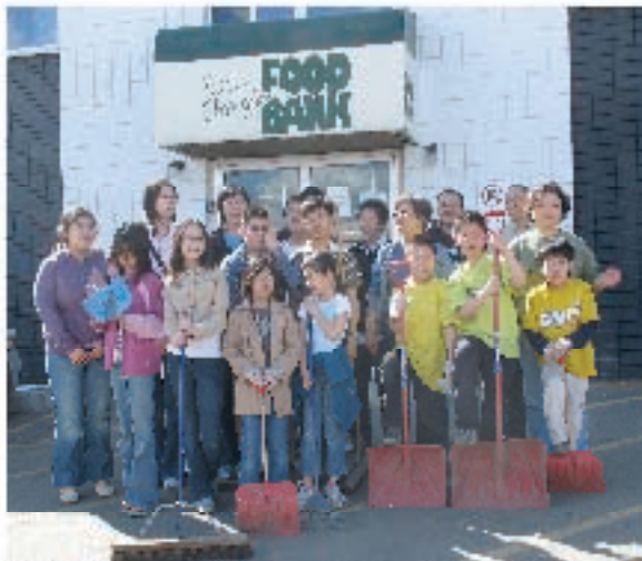
Volunteers make it happen at Edmonton's Food Bank